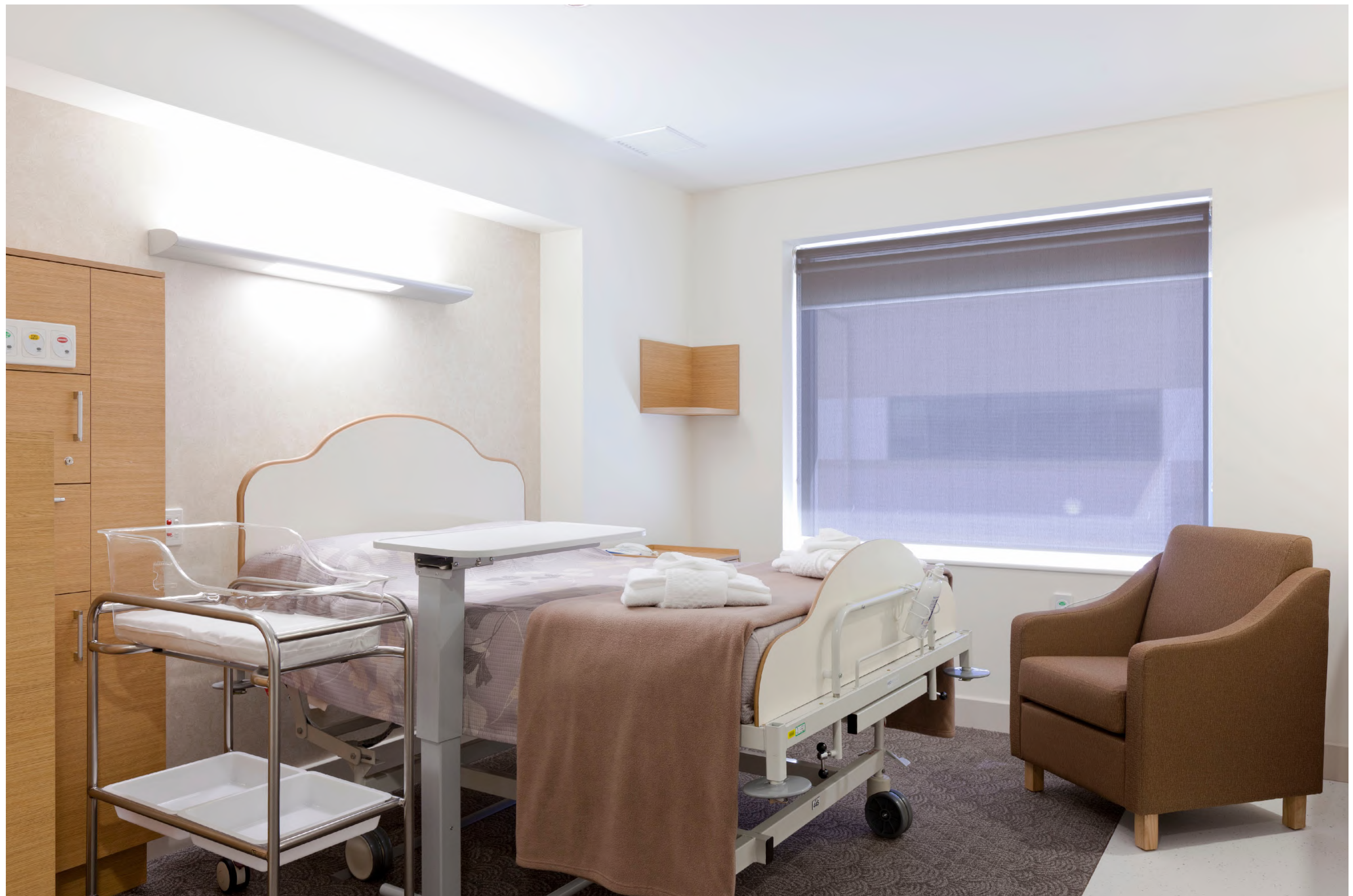
Joondalup Hospital Mental Health Unit Expansion