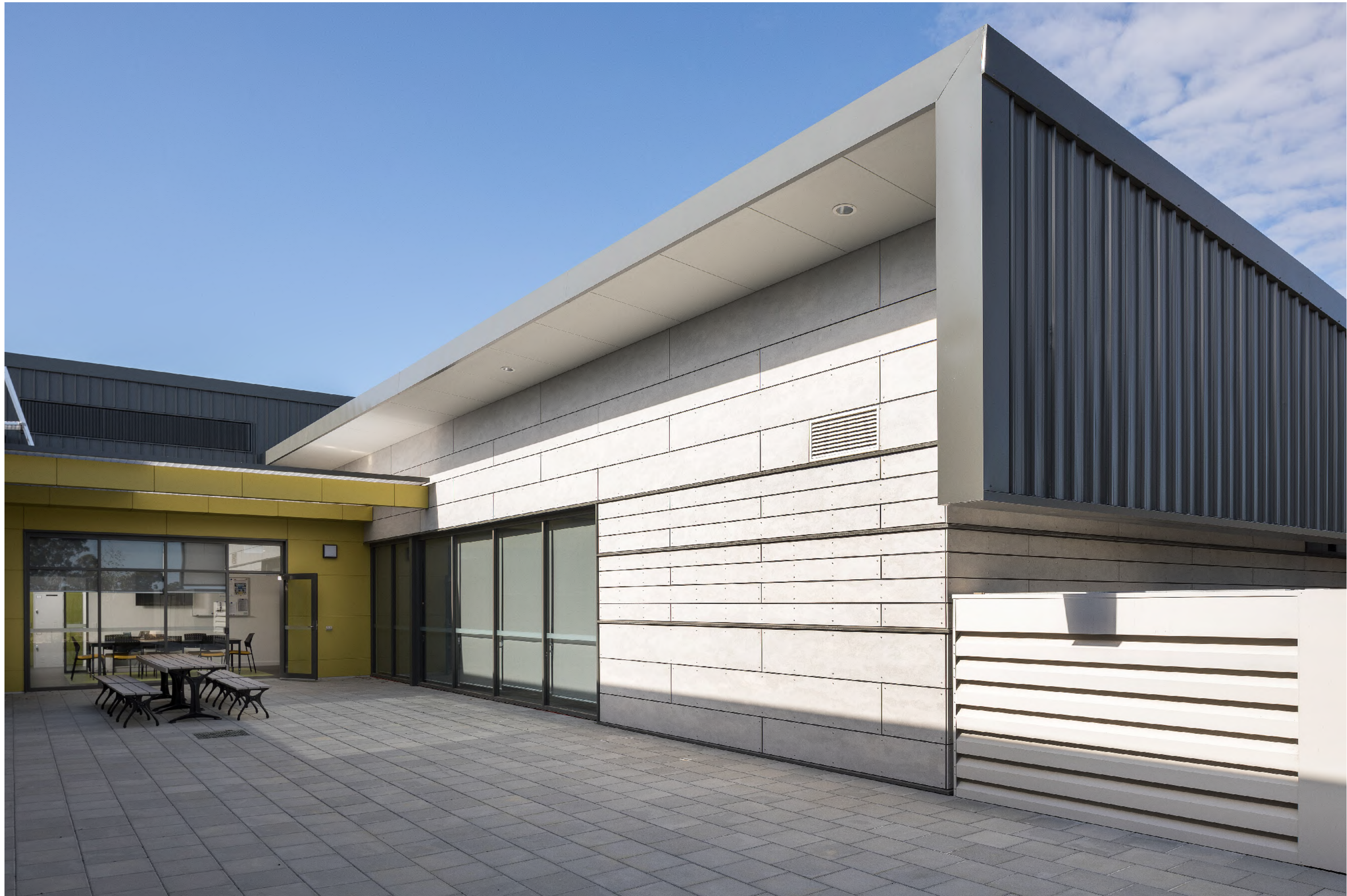
Mundijong Police Station