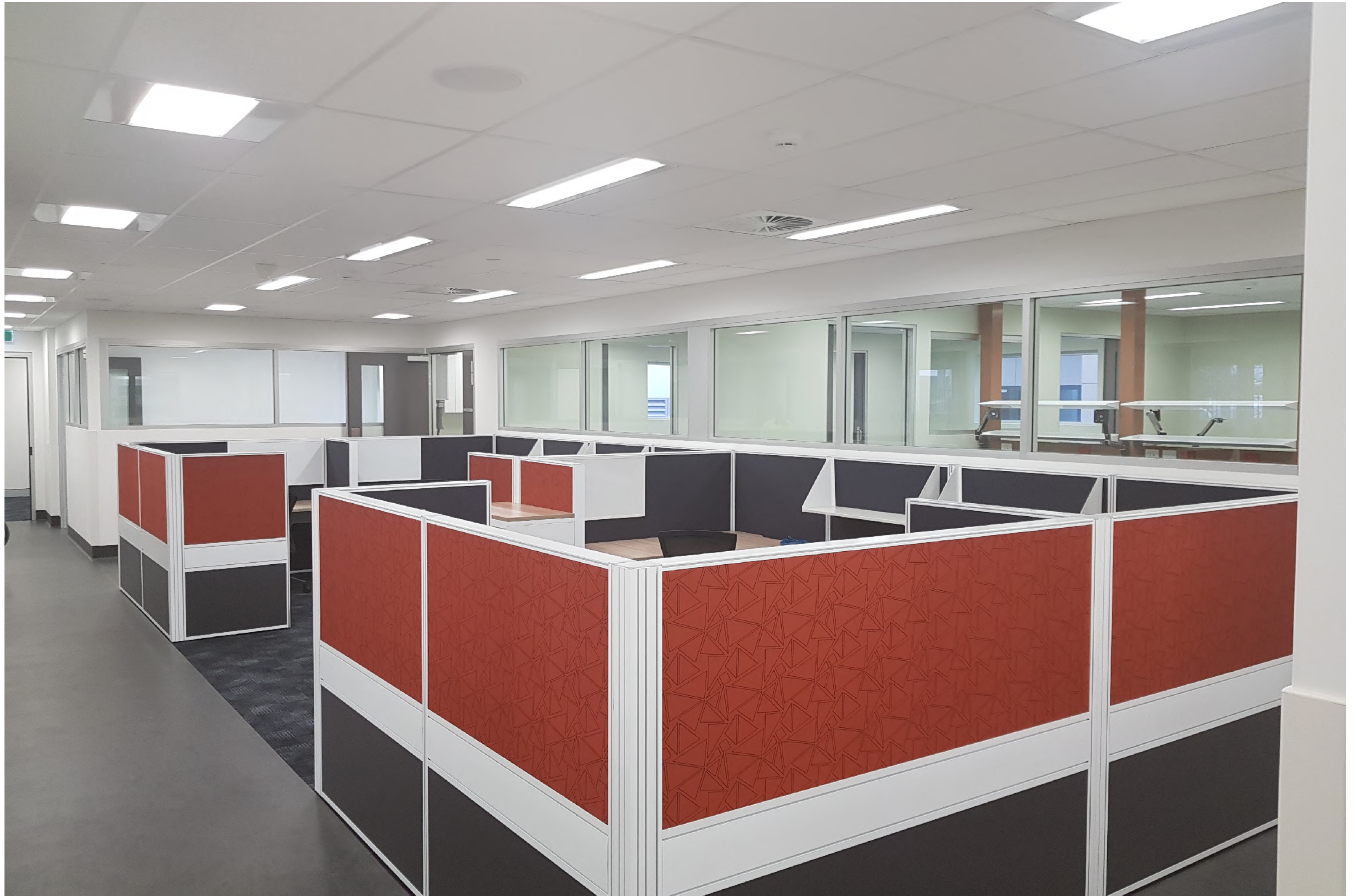
Perth Mint Refinery Assay Laboratory Expansion